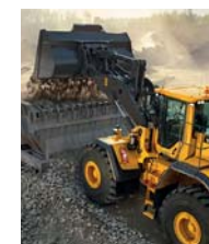
Volvo Construction Equipment