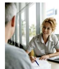
Volvo Financial Services