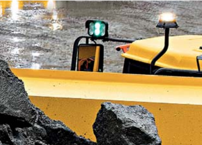
On board weighing