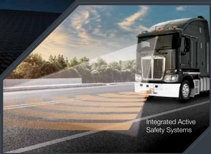
Integrated Active Safety Systems